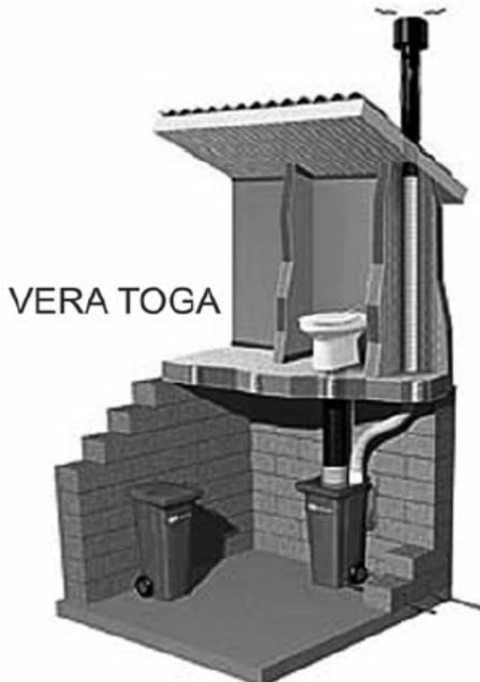
Figure 4. Commercial compost toilet.

An example family of two adults and two children may deposit 21.3kg 21 of excreta in their home compost toilet a week. These excreta would be combined with 17.3 kg of cover material, producing 38.6 kg of material to be collected a week. This would need a receptacle with a holding capacity of about 40 litres. Figure 4 shows a suitable collection device that could be wheeled to the refuse collection vehicle. This material could be taken to municipal facilities or participating farms for composting, together with other organic waste.